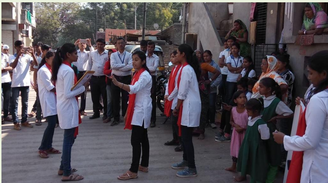
Students performing act to message audience to keep city clean

The Shirpur -varwade Municipal Corporation has participated in the Swachh-Bharat Mission during the year 2017-18. As a part of our individual and social responsibility the principal, faculty and students of H. R. Patel Institute of Pharmaceutical Education & Research, Shirpur has participated in the “Clean Shirpur-Green Shirpur” mission to support the national cause. It was planned to organize the events like awareness rallies, street plays and cleanliness drive to spread the awareness about cleanliness.