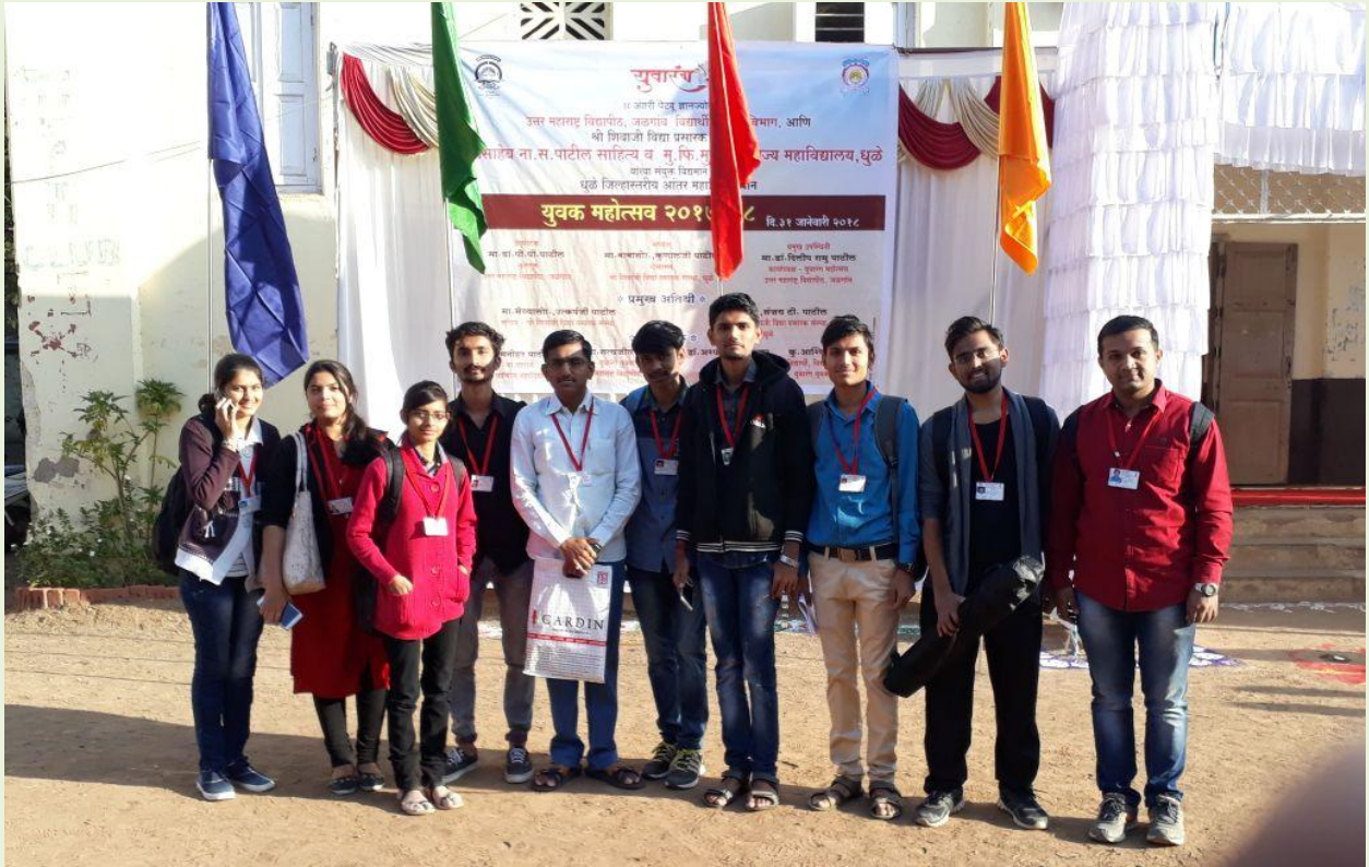
Staff members and students for Yuthfestival Participation