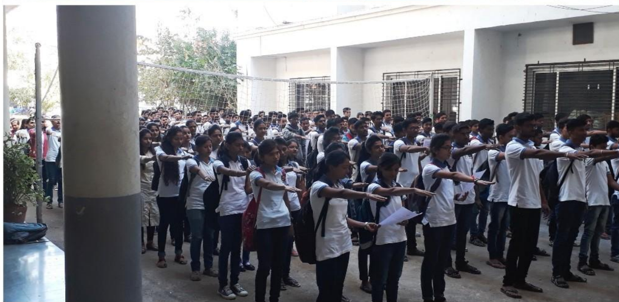
Staff Members and Students taking Oath on National Voters Day