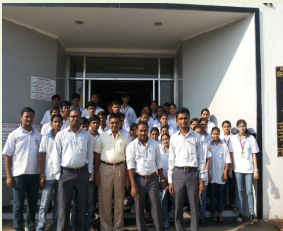
Students and faculty members at IGM hospital, Shirpur

The H. R. Patel Institute of Pharmaceutical Education & Research, Shirpur has organized a Hospital Visit to Indira Gandhi Memorial Hospital, Shirpur. At the reception, students were welcomed by the team members of IGM Hospital. A group of 10 students was made and then a visit to the different departments of the hospital like ICU, ICCU, IN-Patient Pharmacy, pathology lab, CATH Lab, operation theaters, emergency services etc. was arranged. At last, students visited the In-Patient pharmacy store, where they had observed activities like actual storage, purchasing and billing of drugs to patients.