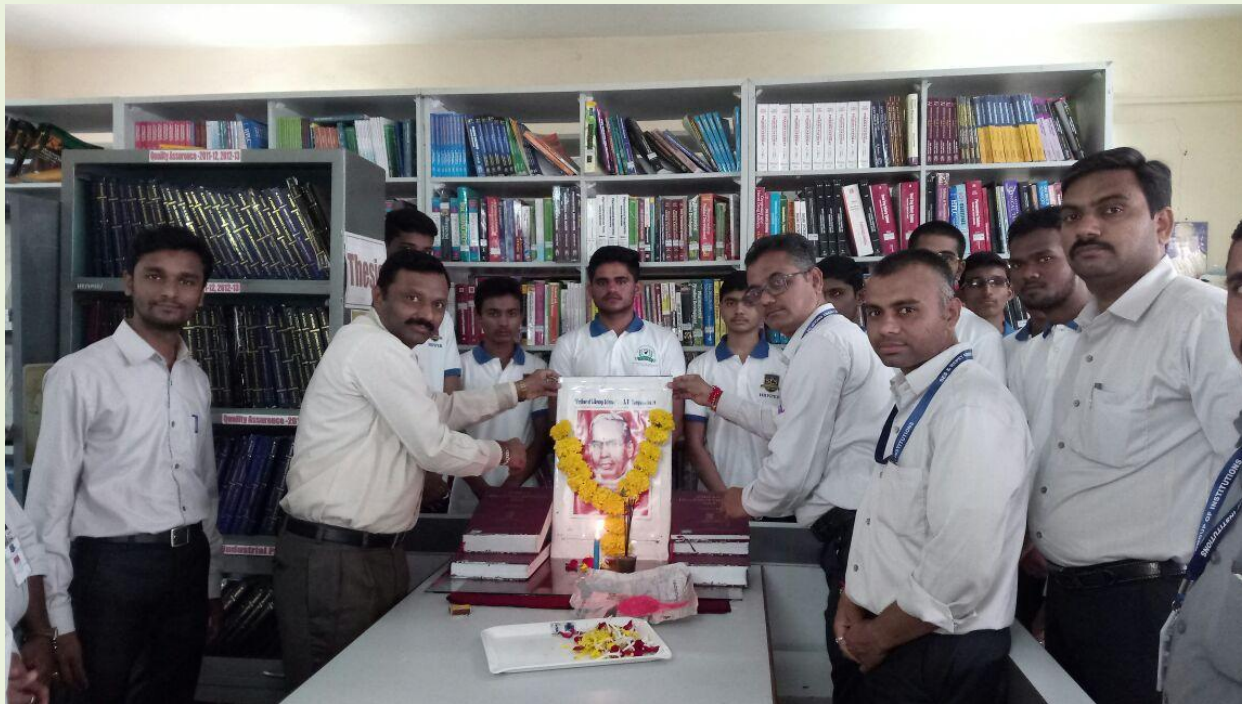
Inauguration of Librarian Day