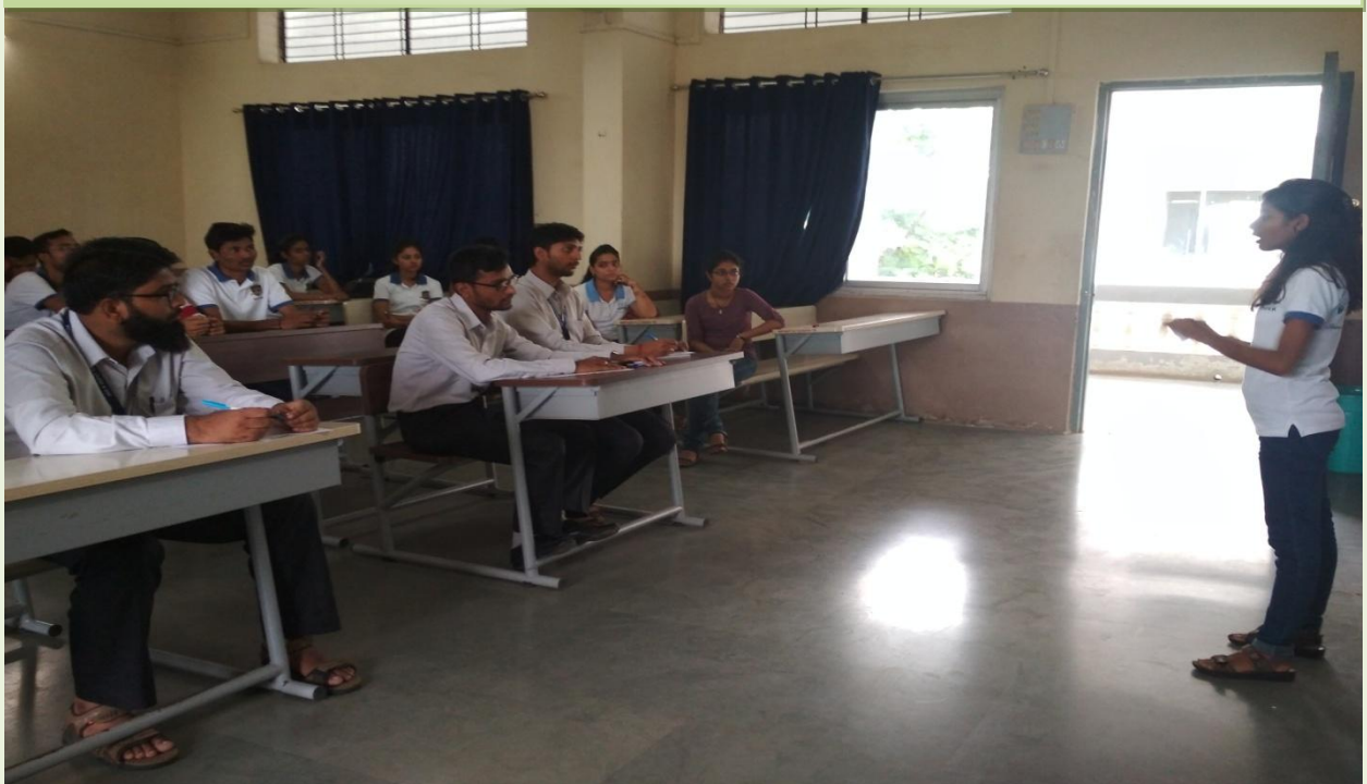
Students performance during Elocution Competition