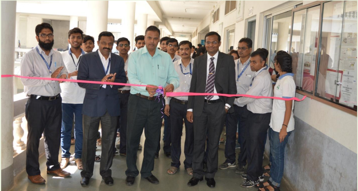
World Pharmacist Day (Rx Technical Poster presentation Inauguration)