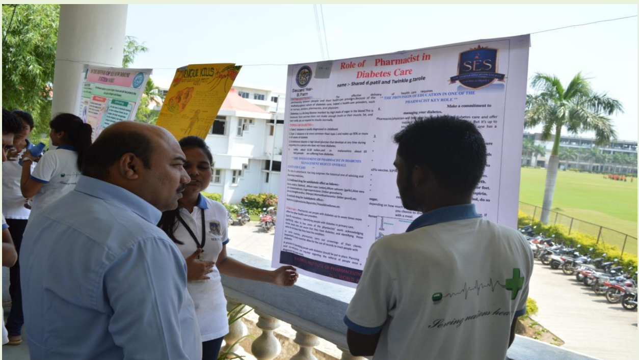
Students during poster presentation before Evaluators