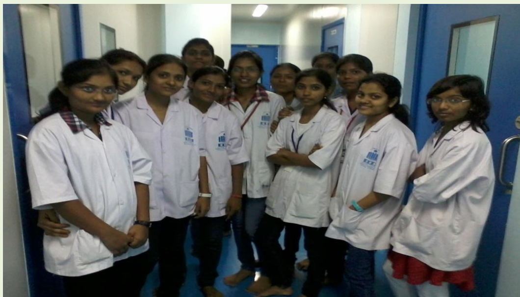
Students during Industrial Visit

Students visited various departments like formulation and development, quality control, quality assurance etc. of SP Pharmaceuticals Ltd.