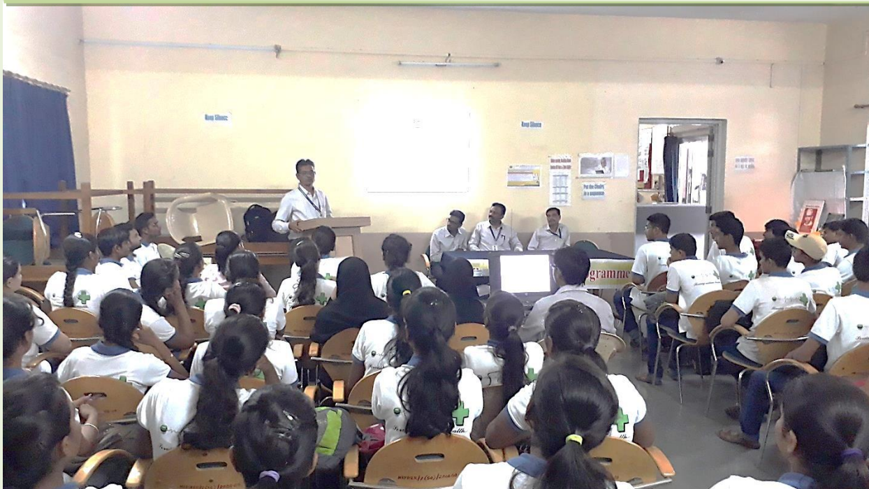
Library Incharge delivering speech on Library user orientation Programme