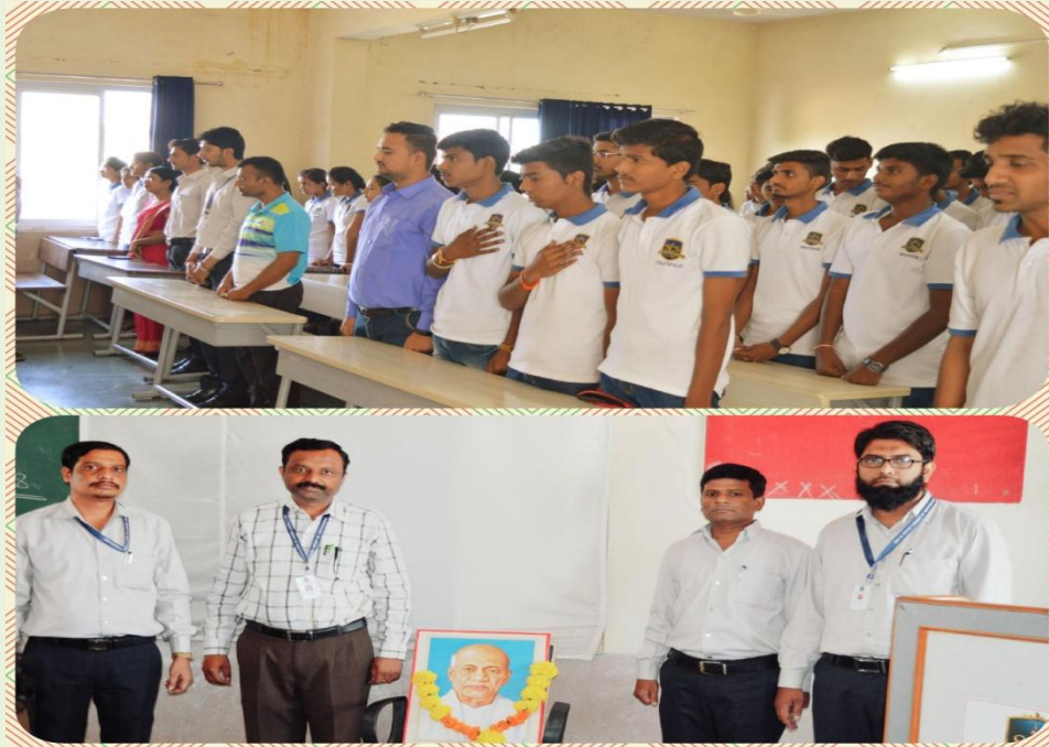
Rashtriya Ekta Diwas Celebration