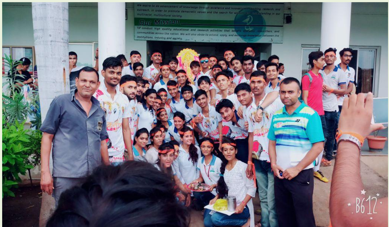
Physical director with students for Ganesh Visarjan