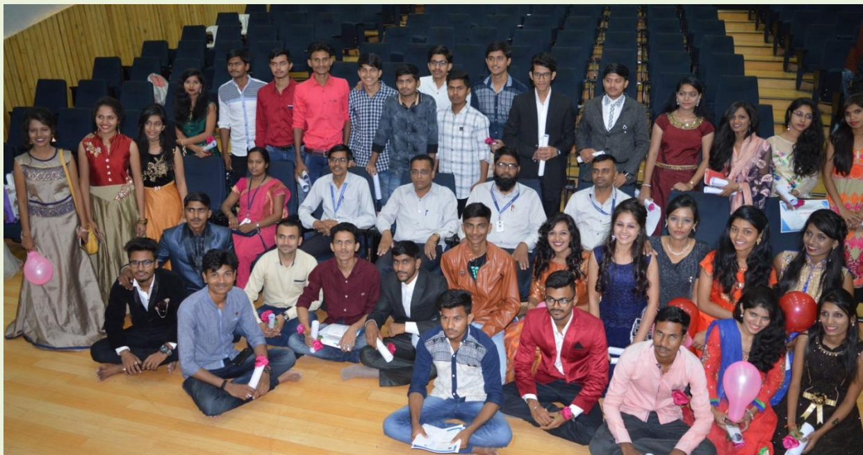
Staff members and Students after Farewell Ceremony