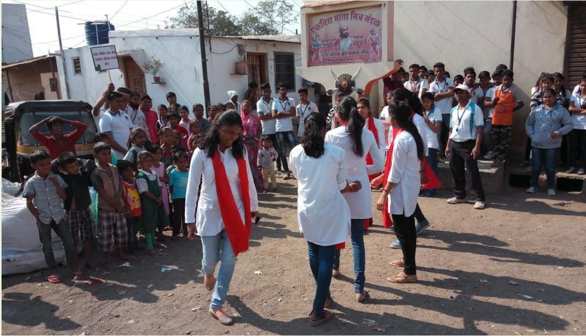
Students performing act to message audience to keep city clean