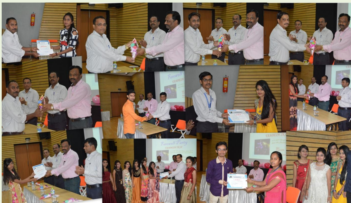
Staff members and students receiving Appreciation awards during Academic Year 2017-18