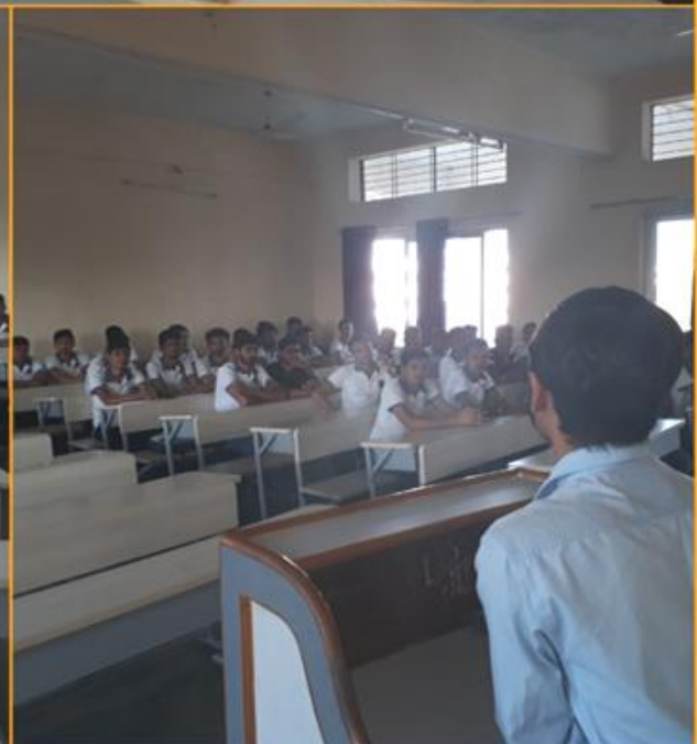
Resource person during interaction with students