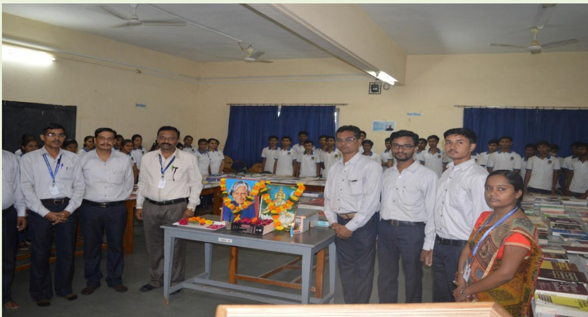
All staff members and Students during Vachan Prerna Din