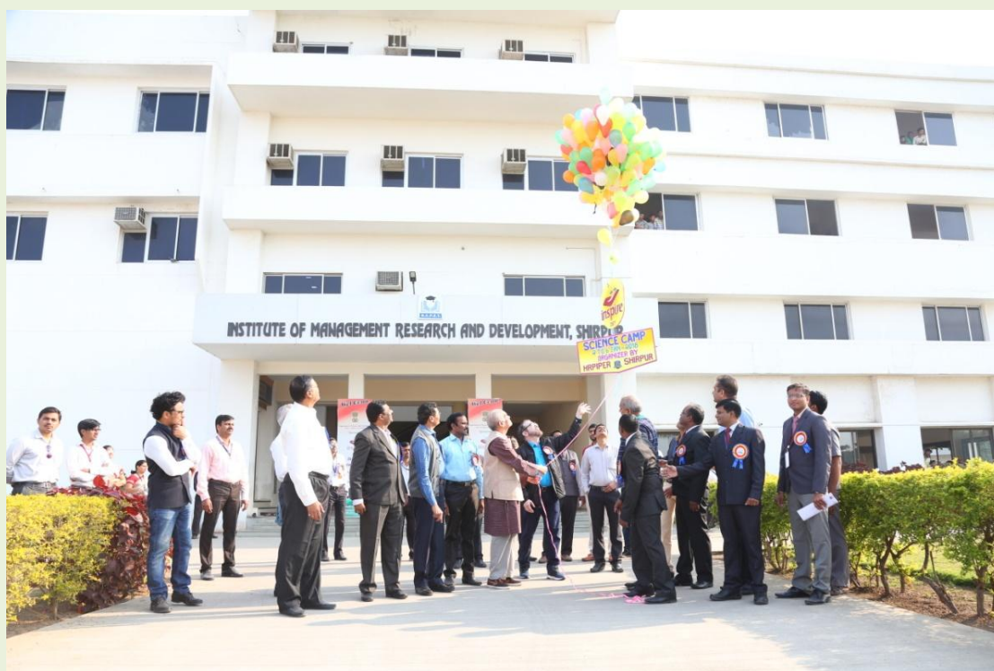
Inauguration of Five days INSPIRE Internship science camp

“Innovation in Science Pursuit for Inspire Research (INSPIRE)” is one of the innovative programs by the Department of Science & Technology for attraction of talent to science. The basic objective of INSPIRE is to communicate to the youth population of the country the excitements of creative pursuit of science and attract talent to the study of science at an early stage and build the required critical human resource pool for strengthening and expanding the Science & Technology system and Research and Development base community.