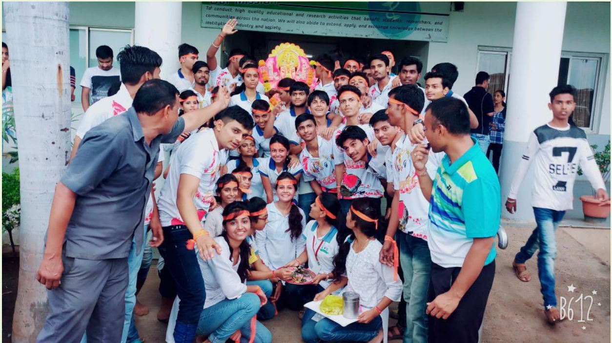
Students during Ganesh Visarjan