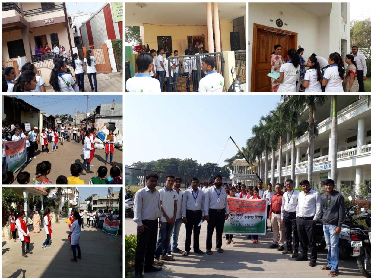
Students participating in various Swachhata Programmes like Rally and Drama to maintain Shirpur City Clean