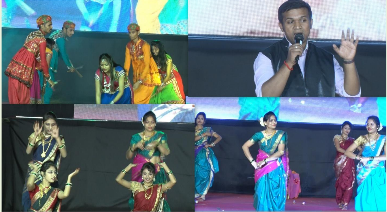
Students Performing during Annual Social Gathering SMILAX- 2018