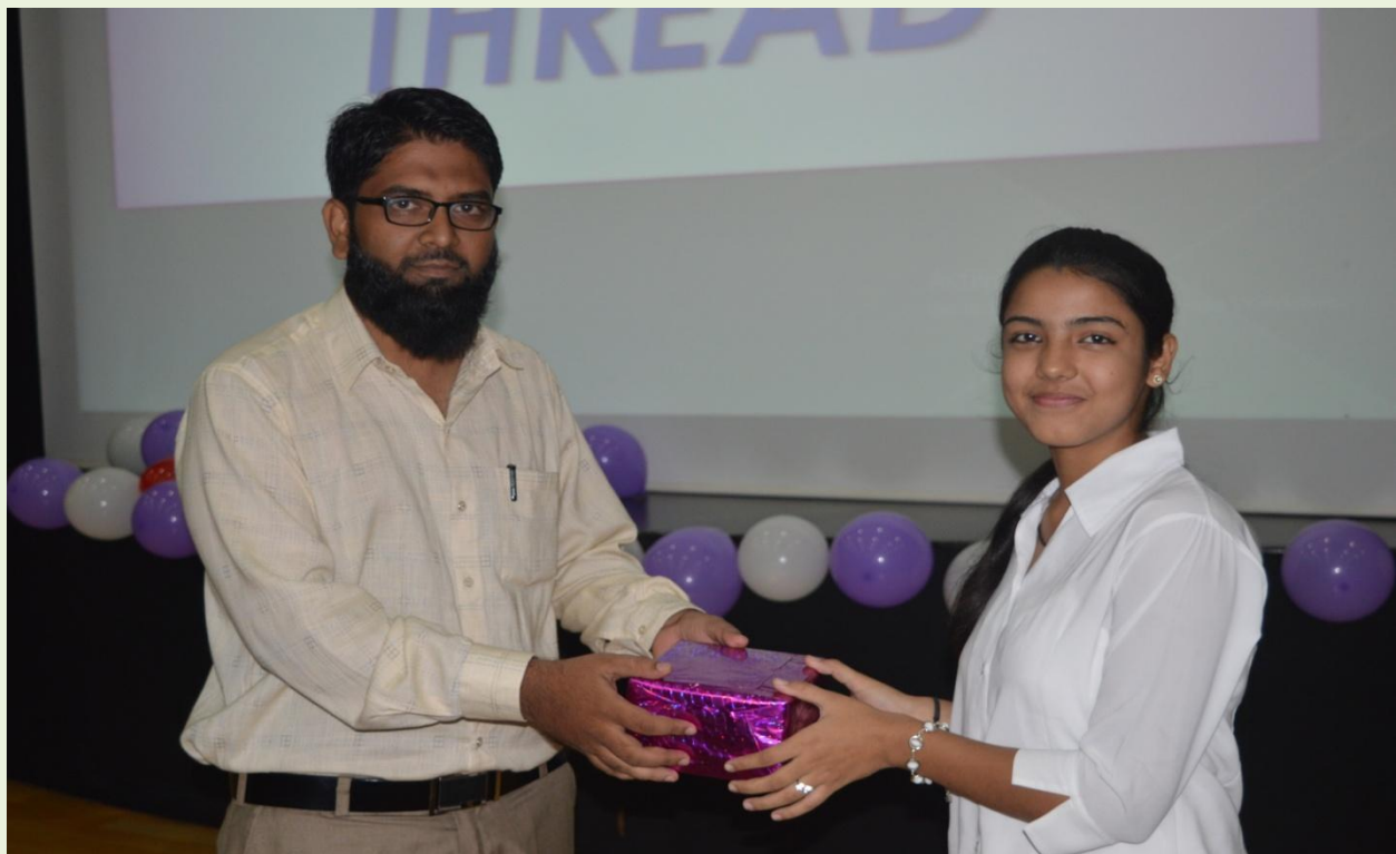
Students receiving prize during Freshers Party