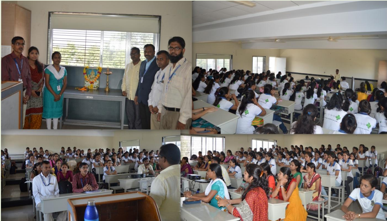
Personality Development Inauguration and Plenary sessions