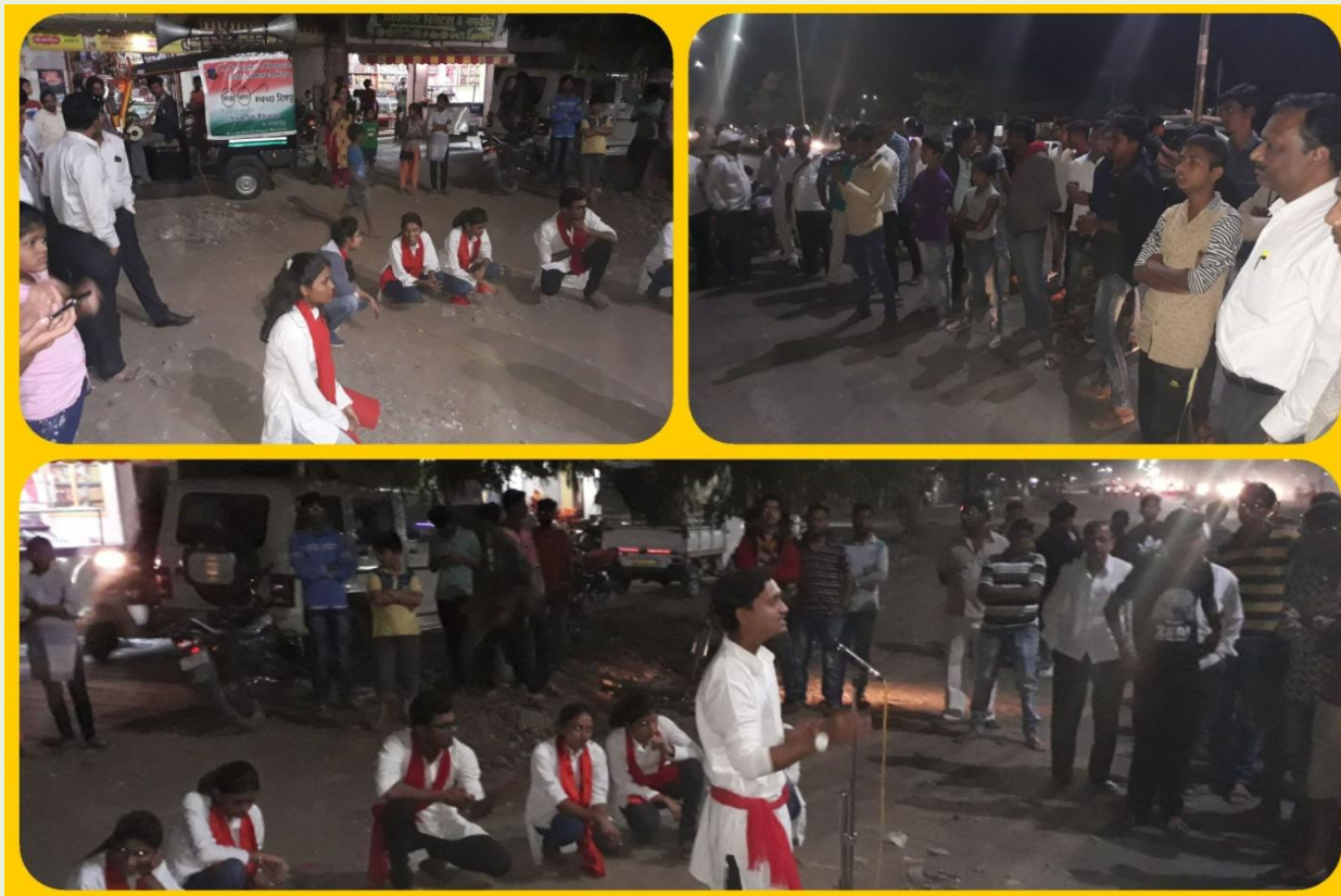
Students performing act for Cleanliness: Swachh Bharat Abhiyan