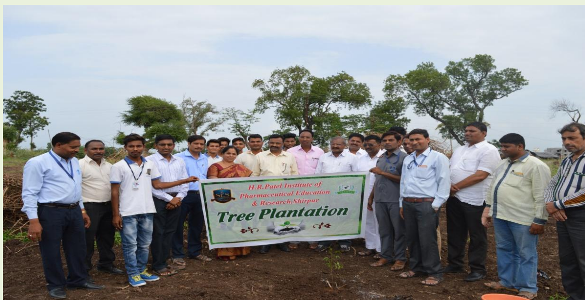
Staff members and Students during Tree Plantation

To make awareness about the importance of trees and initiate the responsibility to save the environment, student & staff of the institute planted more than 125 neem plants at two sites i.e. near water filter plant, Varzadi road and institute premises. Both students and staff members enthusiastically involved in this event.