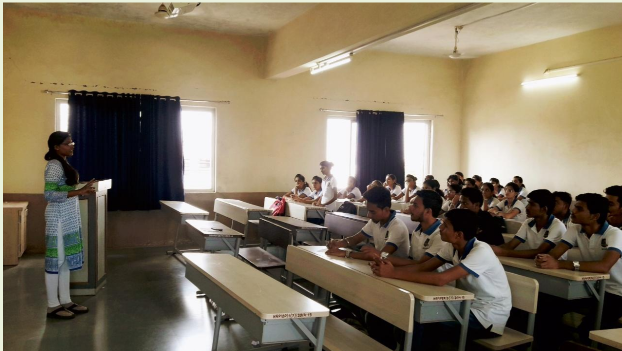
GPAT Orientation Lecture