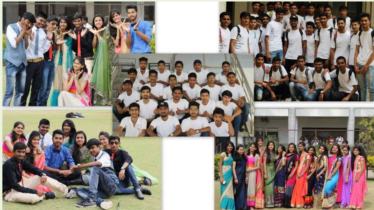
Days Celebration: Traditional and Saree Day