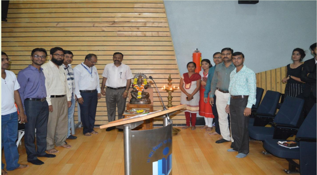
Freshers Party Inauguration