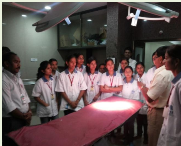
Interaction of students with resident doctors during IGM hospital visit