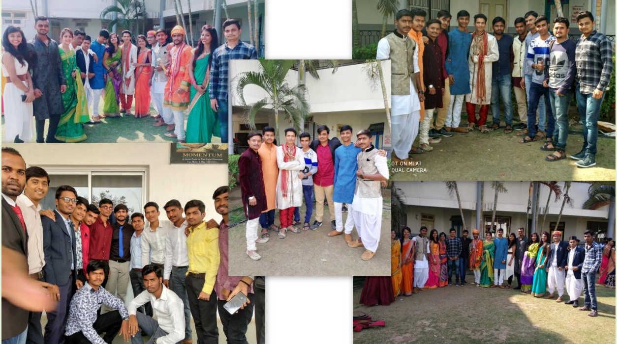
Days Celebration: Traditional Day