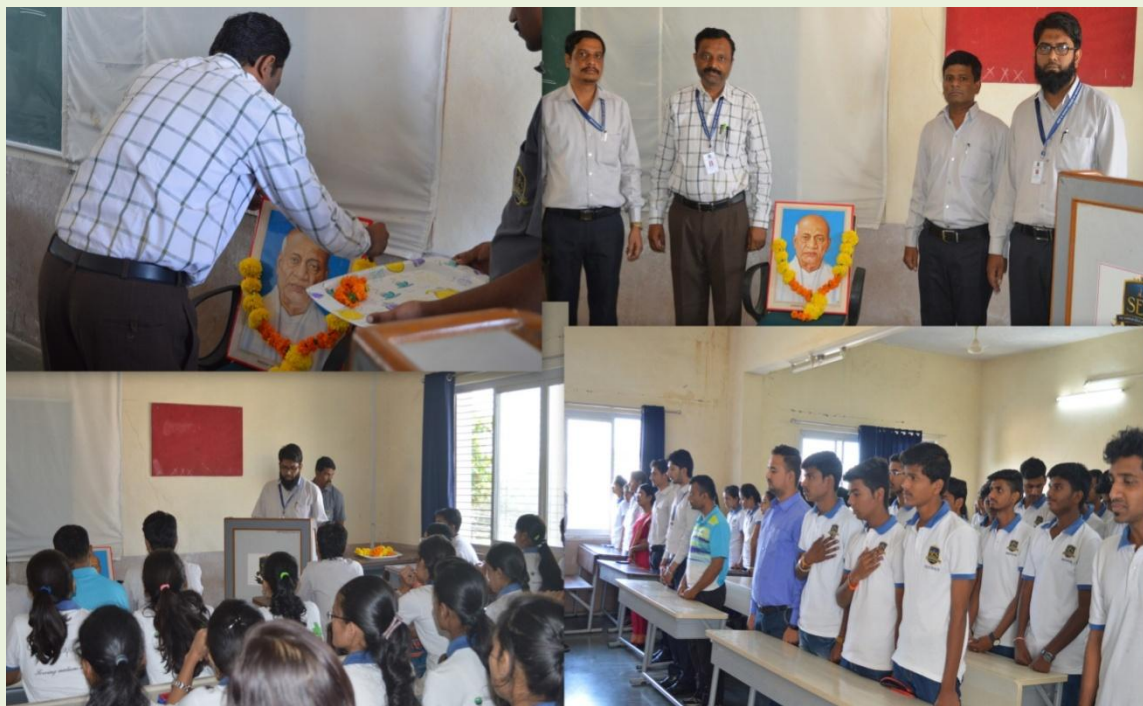
Students taking Oath for National Unity