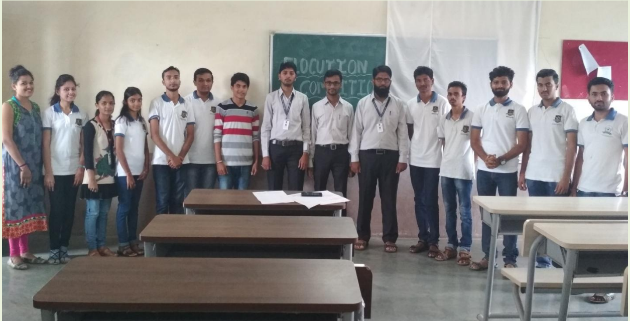
Elocution Coordinators and Students before Competition