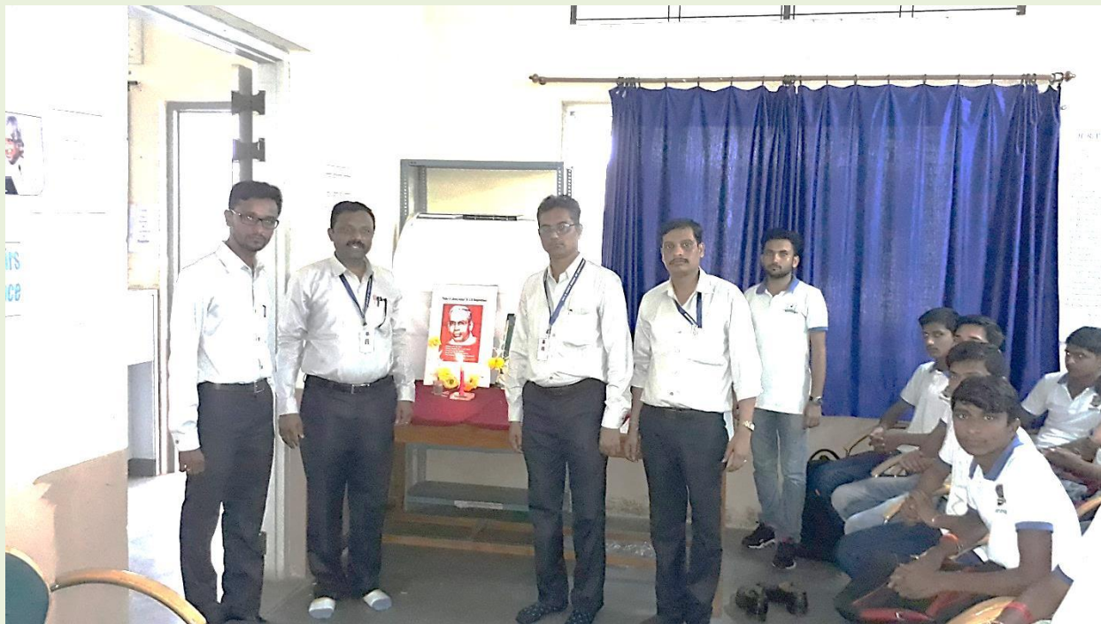
Library user orientation Programme Inauguration