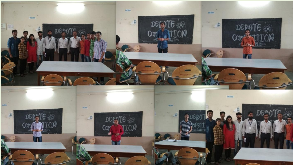
Students performing in Debate Competition