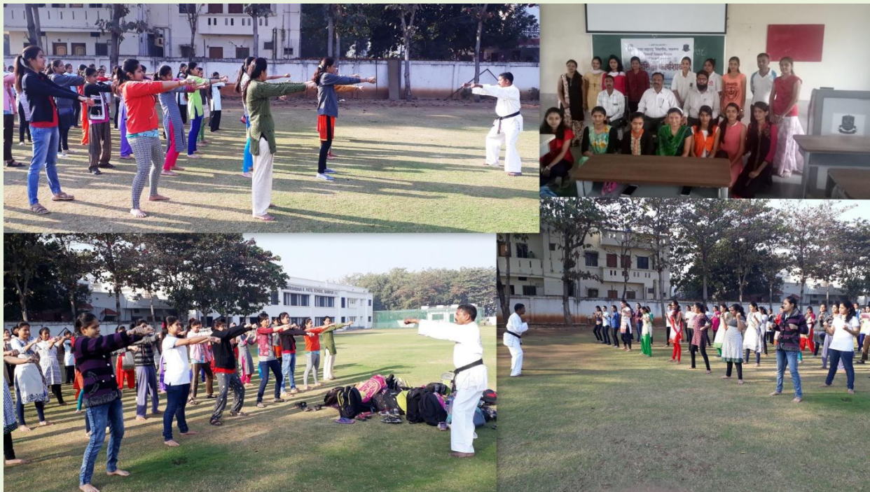
Students performing Karate during Swamsidha Workshop under Yuvatisabha