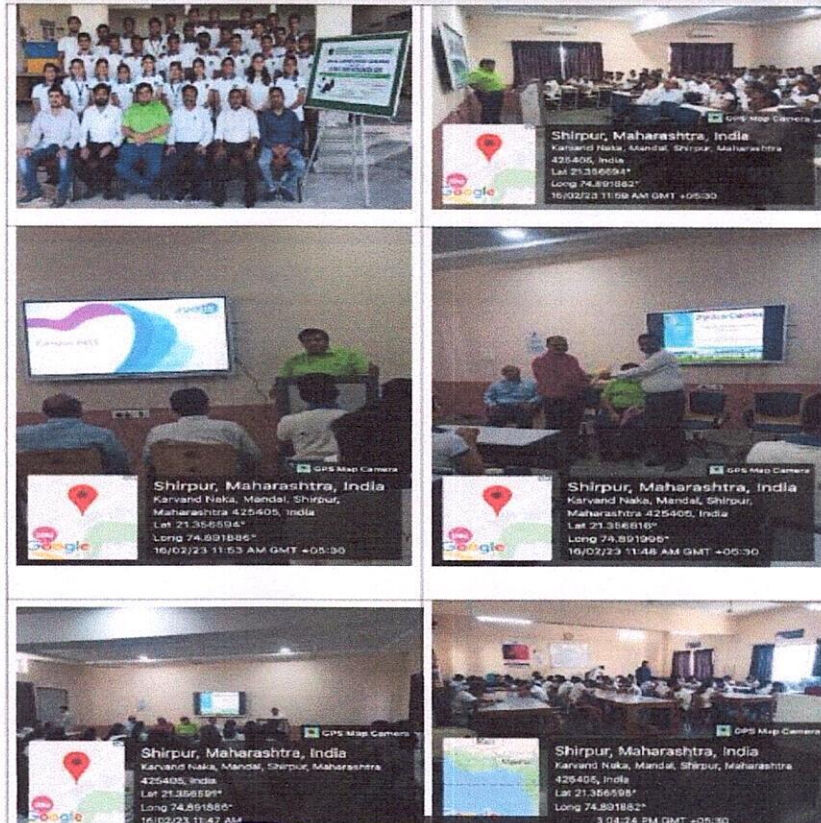
Photograph Of activity